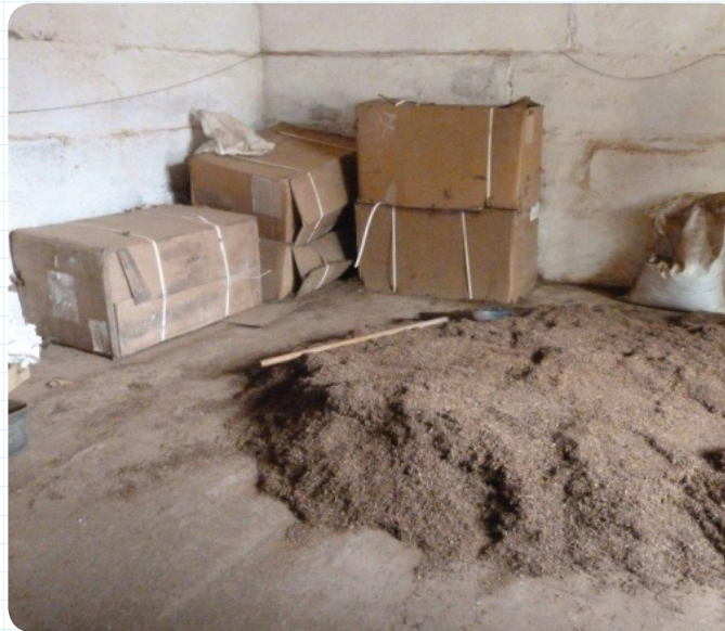
Tobacco mixing at an illegal cigarette production site

Fake cigarettes pose a greater fire risk as they do not include components that ensure they self-extinguish if not actively smoked. They are mainly produced in unsanitary conditions. Laboratory analysis of counterfeit cigarettes showed "ingredients" such as pieces of CD disks and rat excrement.